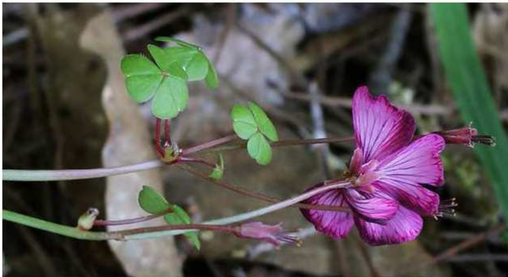
Figure 4. Oxalis brasiliensis in Dallas Co., Alabama, showing production of aerial propagules. Photo by Wayne Barger, 23 May 2013.